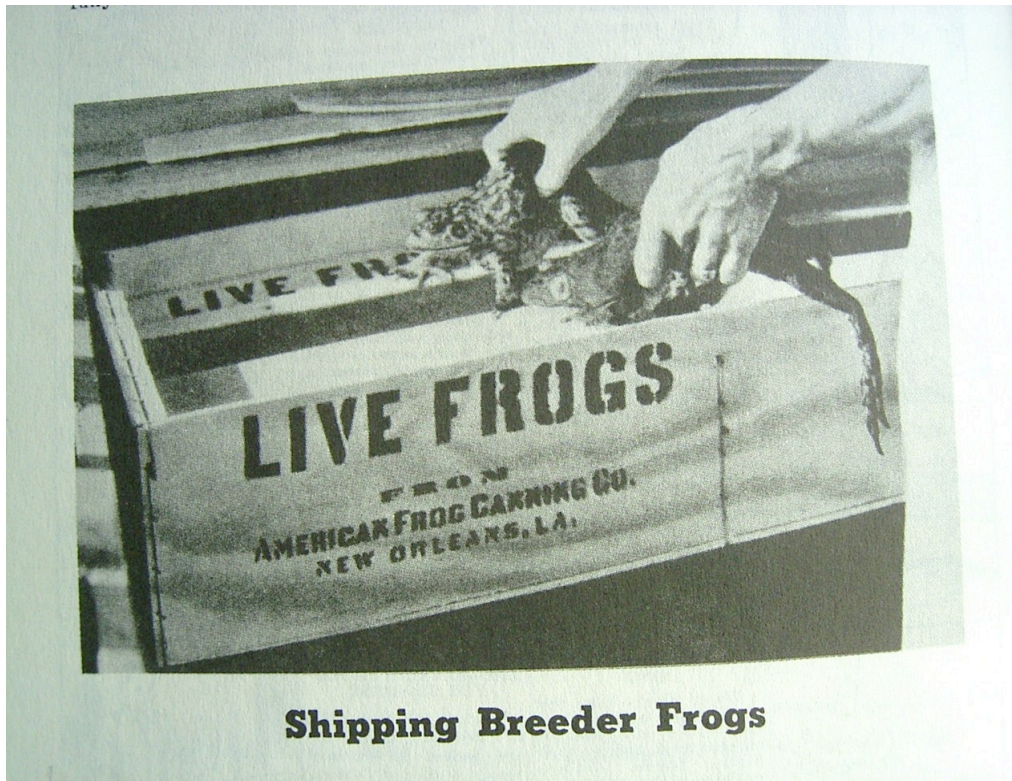
Figure 3 – ‘Shipping Breeder Frogs’ (source: American Frog Canning Co. booklet, 1937).

1937b: 16; The Advertiser , 1937: 25; The West Australian , 1937: 18). The frog farm opened two months later (see Figure 4).