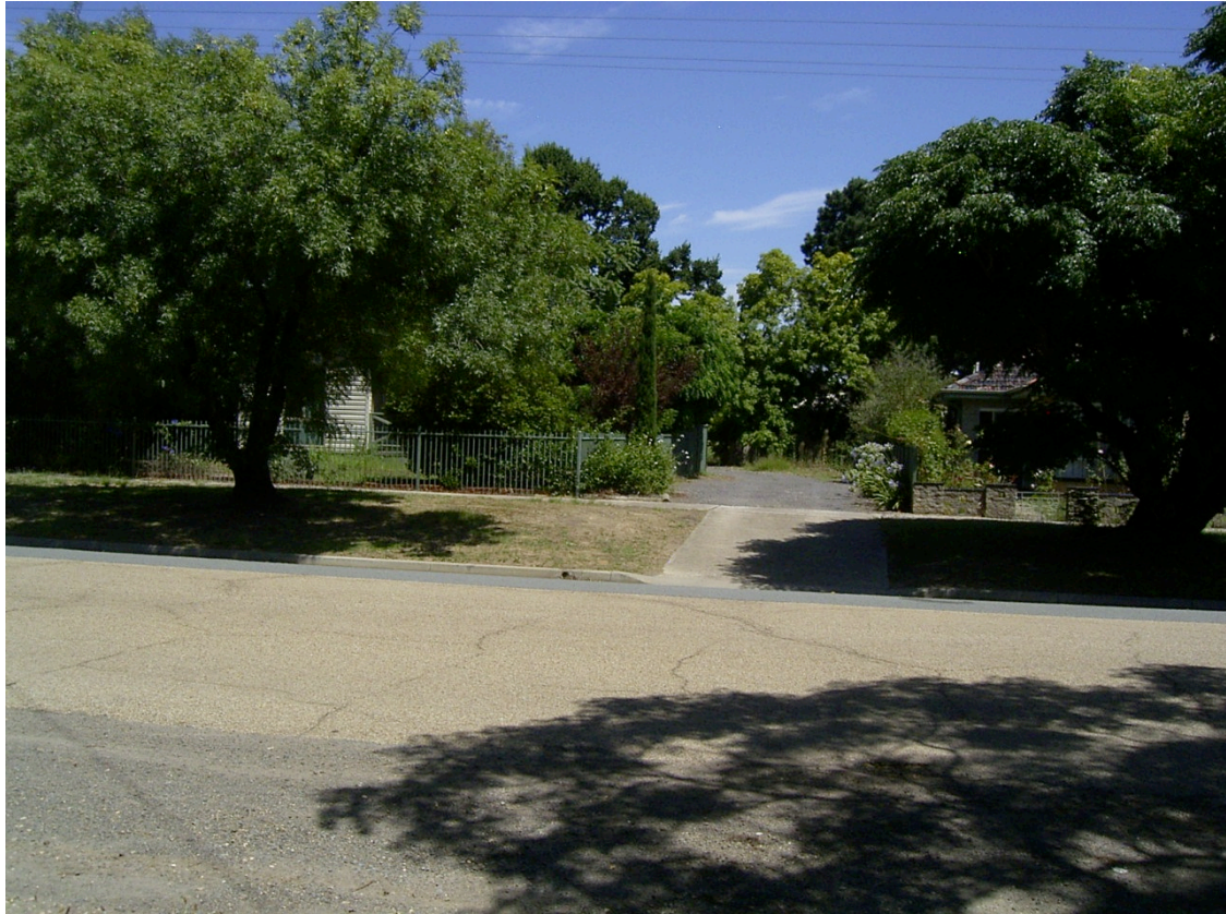
Figure 6 – Site of the former Euroa frog farm, January 2011.