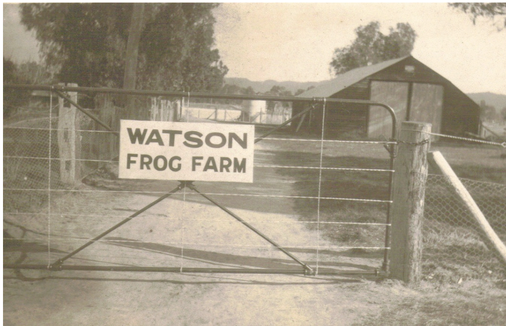
Figure 4 – The Euroa frog farm (‘WATSON FROG FARM’), probably in 1937.

Locale: The Australasian-Pacific Journal of Regional Food Studies