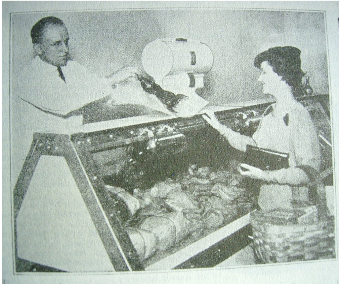
Figure 1 – A fine-sized bullfrog from the butcher’s. An illustration like this might well have inspired two Euroa lads to try frog farming.